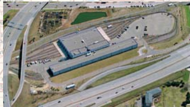
VIRTUAL EARTH © 2007 MICROSOFT