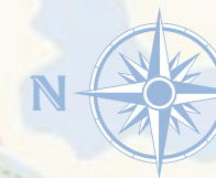
BASE MAP COPYRIGHT © 2007 DELORME