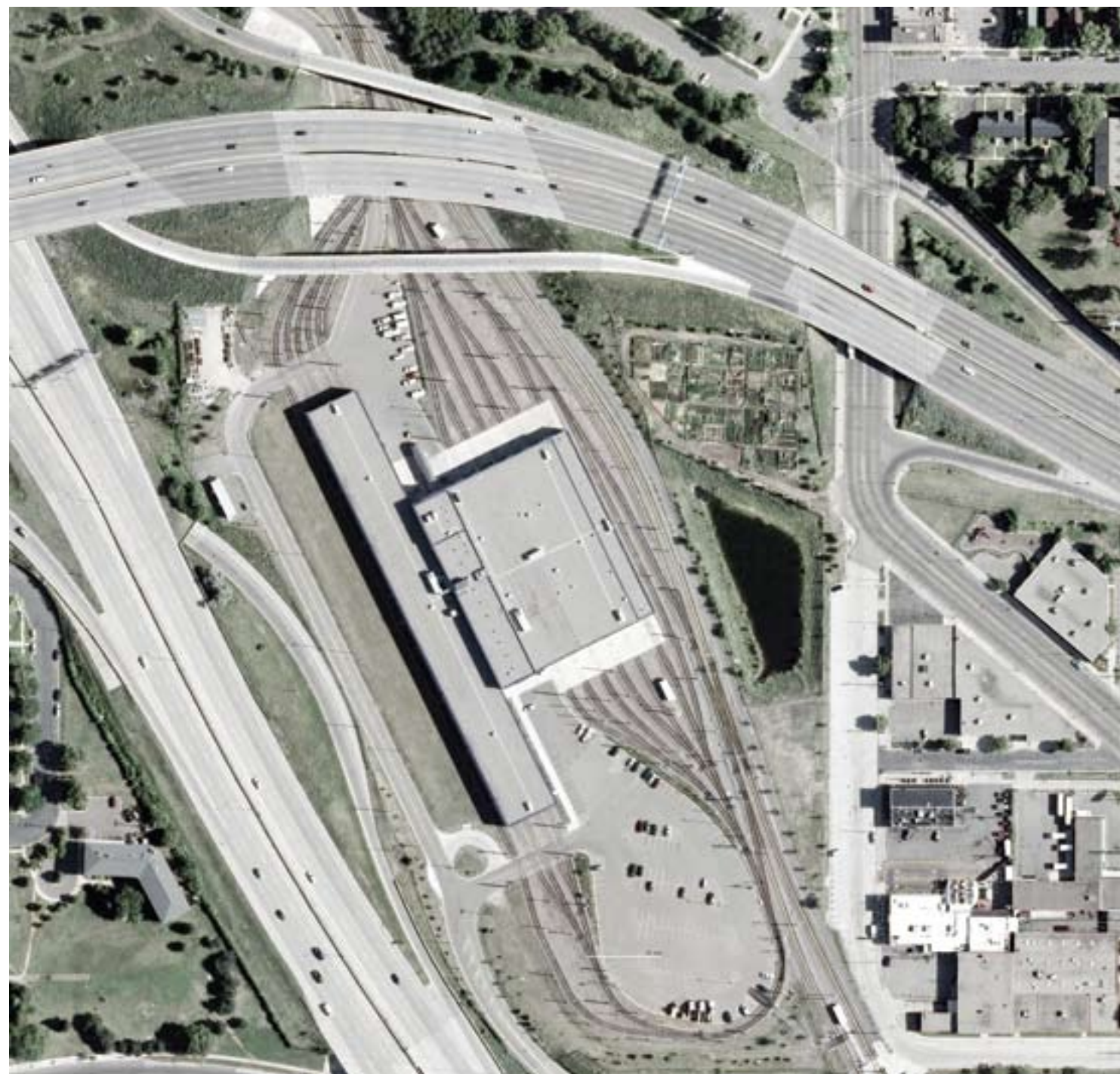
Aerial closeup of Light Rail Operations and Maintenance Facility, looking north.