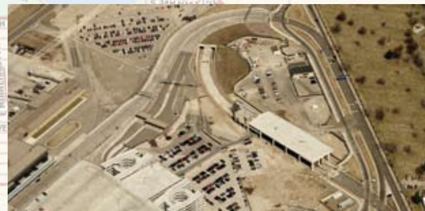
View of airport tunnel portal looking north from Humphrey Terminal station.