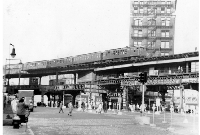
Another view of Chatham Square.