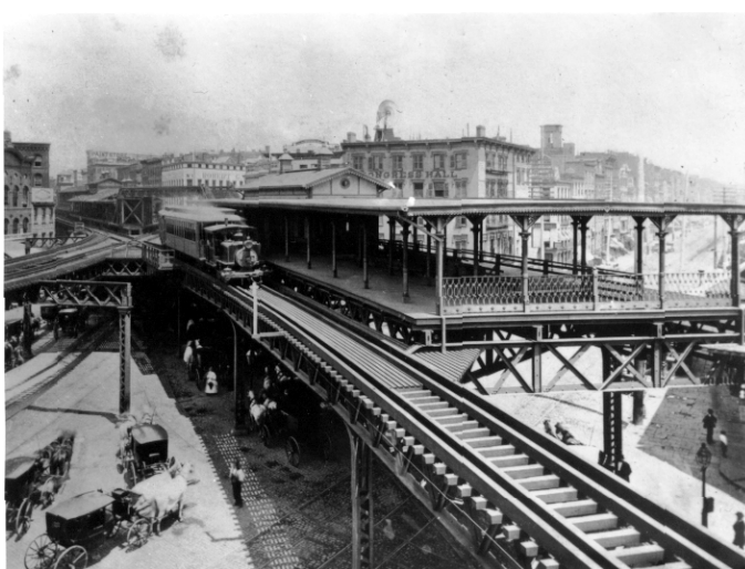
Manhattan Railway, Chatham Square, 1880.