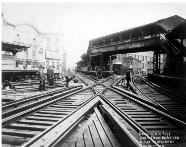
Rebuilding Chatham Square, February 8, 1915.