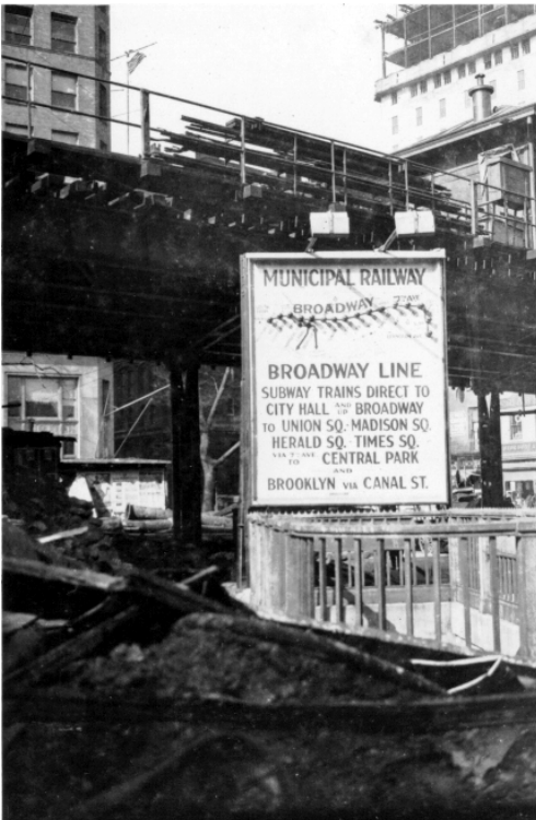
←The Whitehall Street station is seen under construction.

In this second Whitehall Street station construction photograph, we see a power transformer being lowered into the ground.→