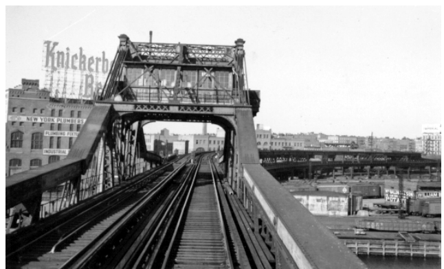
Harlem River Bridge, looking north, May 9, 1955.