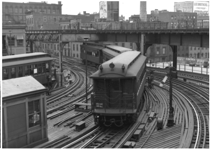
Three-car South Ferry-129 th Street Local at 129 th Street, May, 1940.