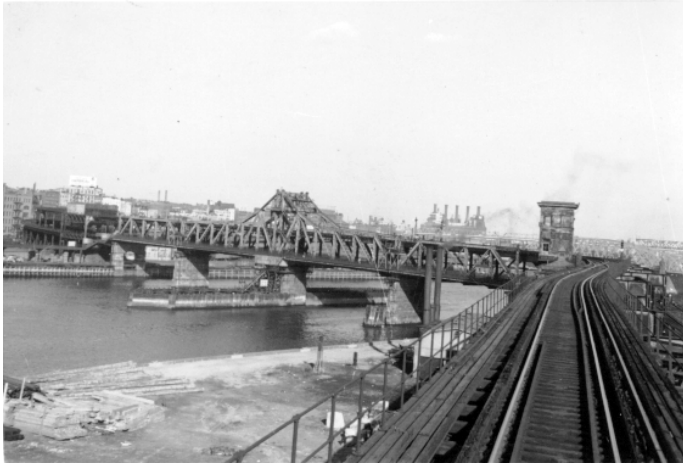
Harlem River Bridge, looking north from 129 th Street station, May 9, 1955.