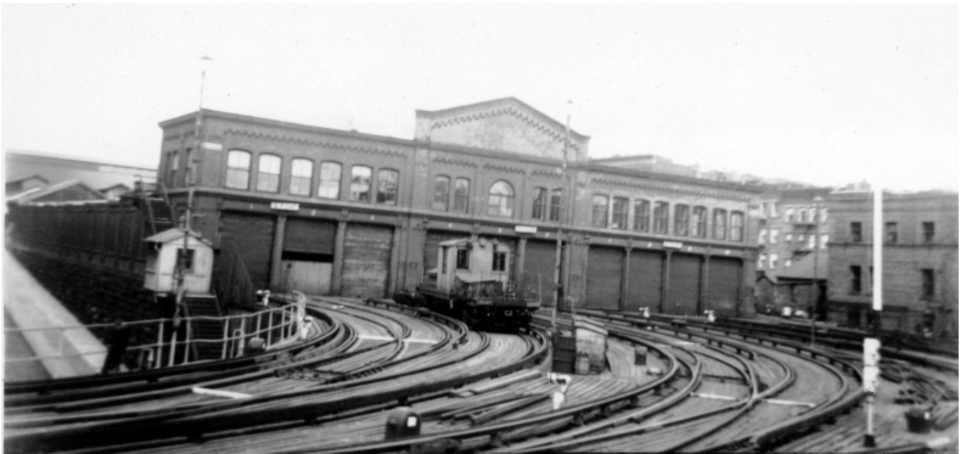
99 th Street Yard, which closed April 30, 1949.