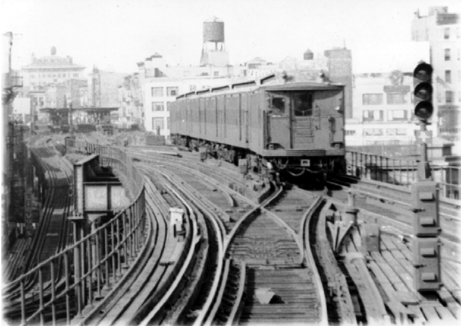
Looking north from Chatham Square, upper level.