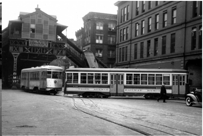
Car 618 pulls car 584 to the E. 129th Street-Third Avenue Car House's 130th Street barn for painting on June 19, 1938.