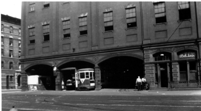
Amsterdam Car House at Amsterdam Avenue and W. 129 th Street, July 28, 1946.