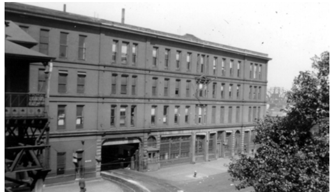
Harlem Car House, E. 129 th Street and Third Avenue, October 6, 1946.