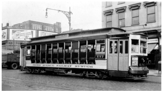
Car 697 at Amsterdam Avenue and W. 155th Street in May, 1939.