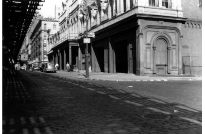
65 th Street Car House, October 6, 1946.