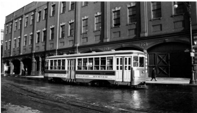
Car 624 outside Amsterdam Car House.