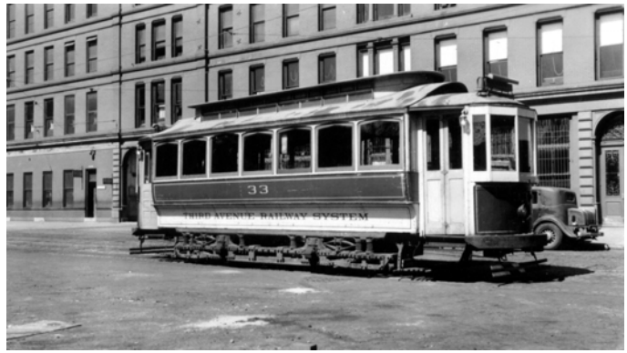
Car 33, seen here in 1940, is an ex-cable car that is now at the Shore Line Trolley Museum.