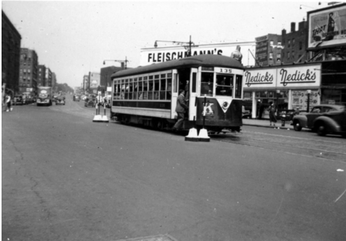
Car 135 works the Kingsbridge Line at Dyckman Street and Broadway on May 31, 1941.