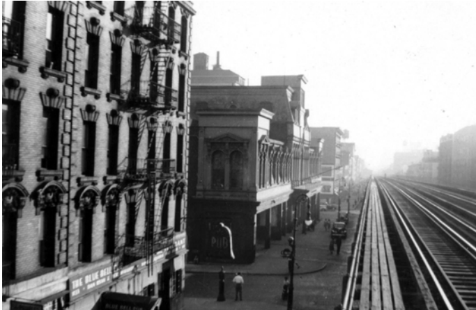
The Third Avenue "L" at E. 66 th Street on October 6, 1946, showing the 65 th Street Car House.

Below are some photographs depicting street car operation in Manhattan.