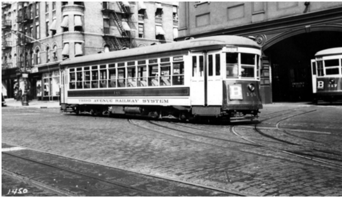
Car 146 outside Amsterdam Car House.