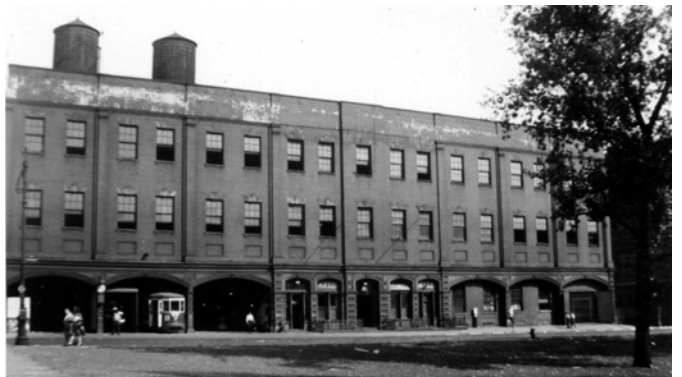
Another view of Amsterdam Car House, taken the same day.