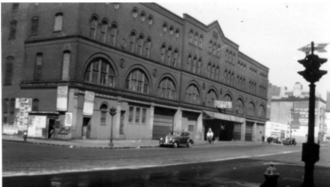
54 th Street and Tenth Avenue Car House, October 6, 1946.