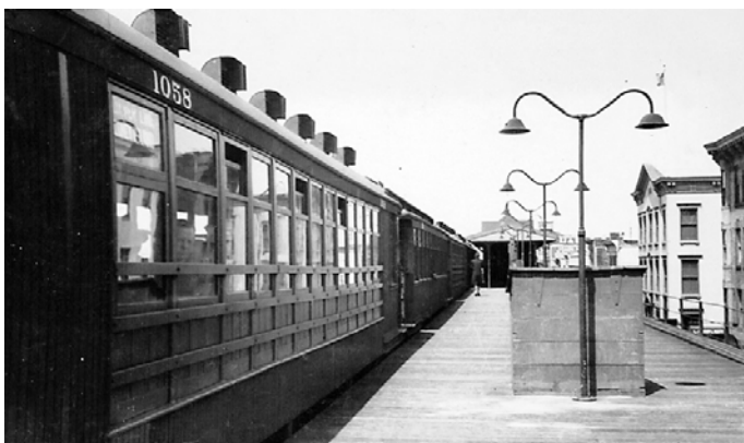
Car 1058 at the 15 th Street station. May 30, 1940.