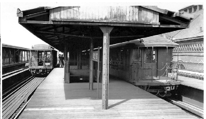
36 th Street, September, 1939. The train on the left is a one-car shuttle, while the one on the right is a Culver train from Coney Island.