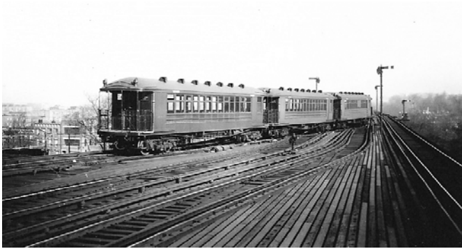
36 th Street looking north, December 24, 1937.