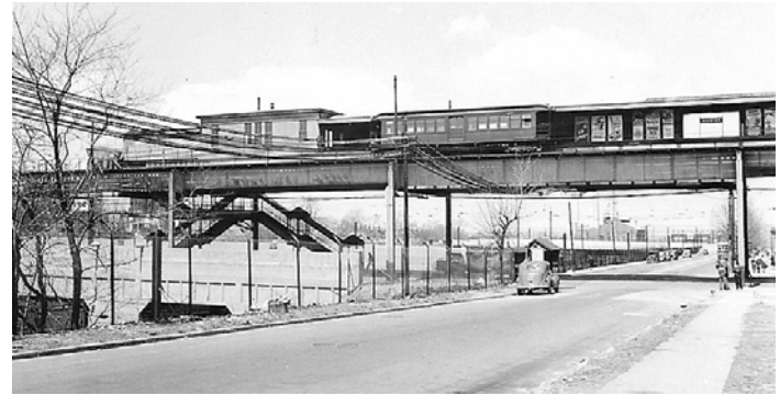
The 65 th Street terminal on Third Avenue, May, 1940.