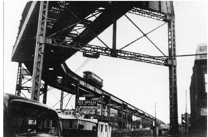
38 th Street and Third Avenue looking eastbound.