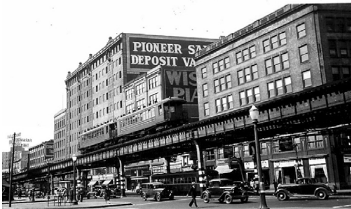
Train of 1000-series cars on Flatbush Avenue between Fulton Street and Fifth Avenue.