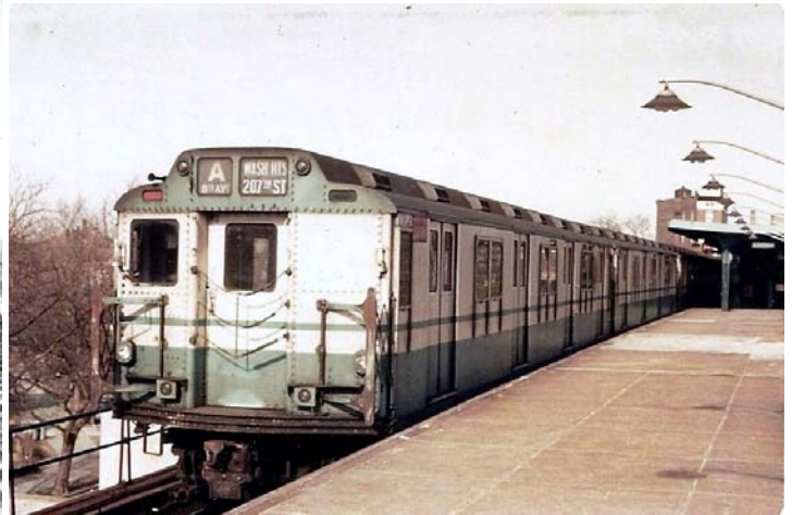
R-10s in the mid-1960s paint scheme at Far Rockaway-Mott Avenue.