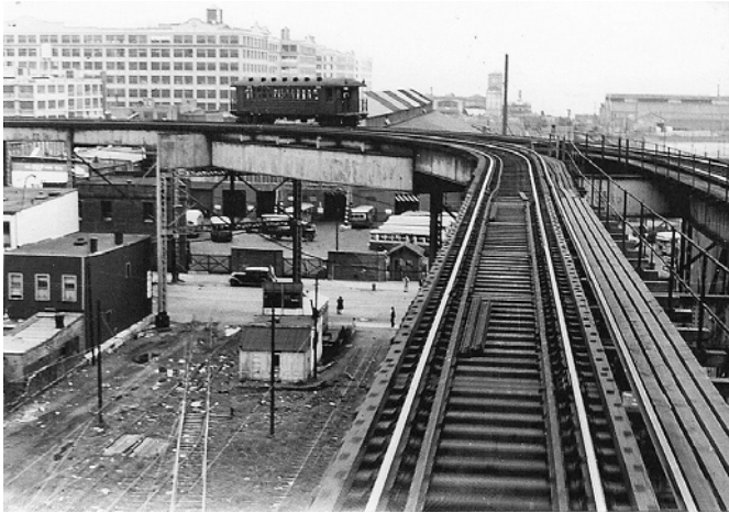
38 th Street and Third Avenue looking westbound.