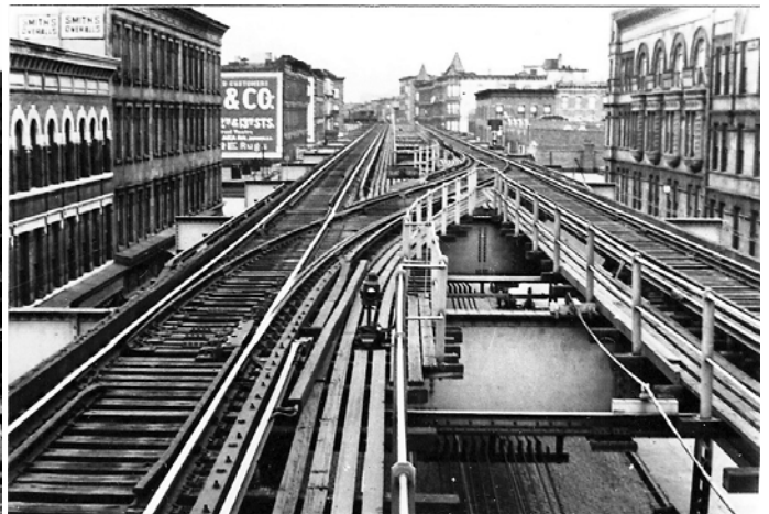
View from Third Street, looking north, showing hand-throw switches.