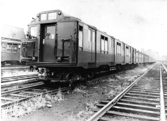
A train of R-10 cars in original paint scheme in 207 th Street Yard.