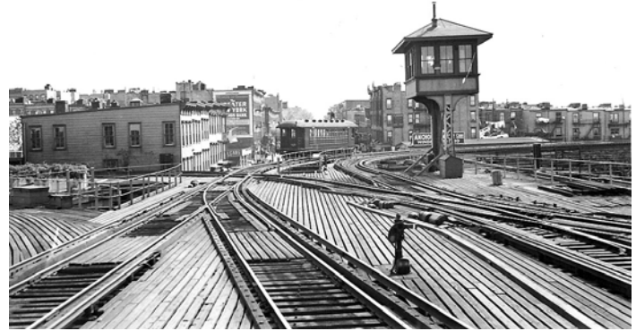
View south from 36 th Street, with a single-car shuttle train coming from 65 th Street, September, 1939.