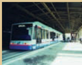
HOWARD R. CLARK

Generation Gap. (right) Sydney Light Rail cars 2103 and 2107 are shown on opening day in the Central Railway Station